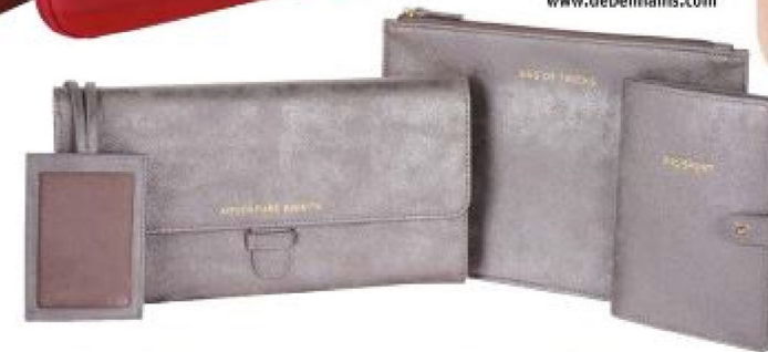
TRAVEL TALE Grey 'Adventure Awaits', travel wallet, £15, (other items available in the set), www.debenhams.com