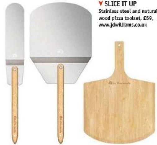
SLICE IT UP Stainless steel and natural wood pizza toolset, £59, www.jdwilliams.co.uk