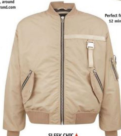
SLEEK CHIC New season Lambretta zip-up Harrington bomber jacket in Stone, £70, www.riverisland.com