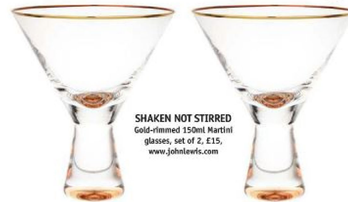
SHAKEN NOT STIRRED Gold-rimmed 150ml Martini glasses, set of 2, £15, www.johnlewis.com