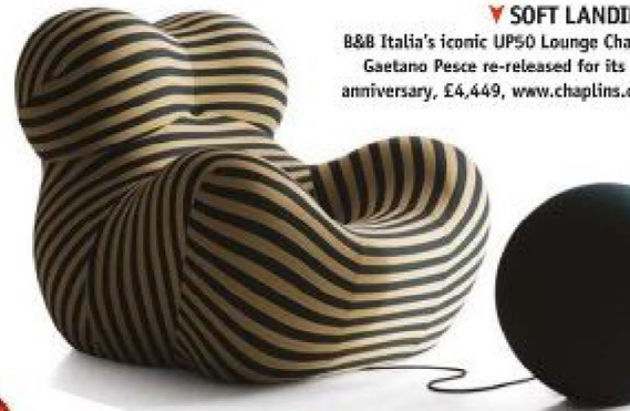
SOFT LANDII B&B Italia's iconic UP50 Lounge Chair by Gaetano Pesce re-released for its 50th anniversary, £4,449, www.chaptlins.com

Our bumper shopping round-up has all the latest Made in Italy must-buy accessories and tempting new products for your home or for friends