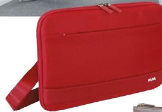
CARRY ON Italian made Easy+ laptop bag in assorted colours, £65, www.navadesign.com