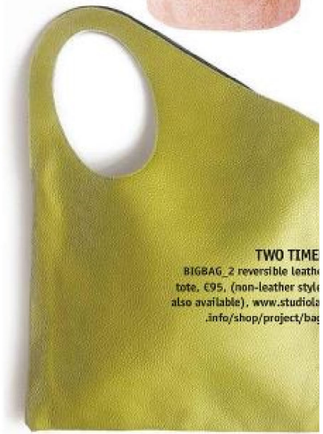
TWO TIME BIGBAG_2 reversible leather tote, £95, (non-leather style also available), www.studiola.com/info/shop/project/bag