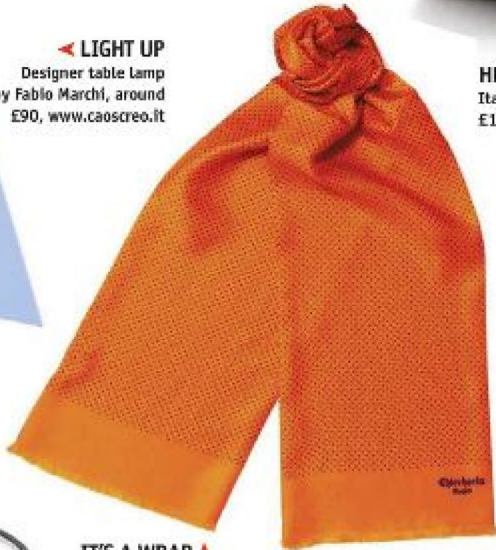
IT'S A WRAP Made in Italy 100 per cent pure silk scarf, 160cm long, around £80, www.chiccheriabrand.com