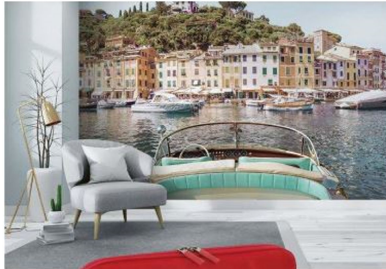
PORTOFINO BOAT Giant-sized wall mural, photo by Paul Fuentes, £32, www.wallsauce.com