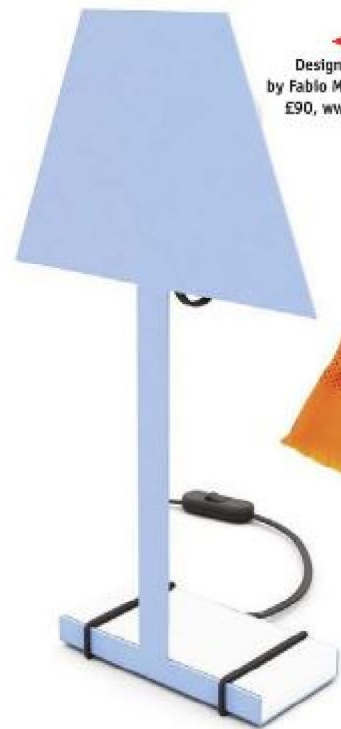
LIGHT UP Designer table lamp by Fabio Marchi, around £90, www.caoscreo.it